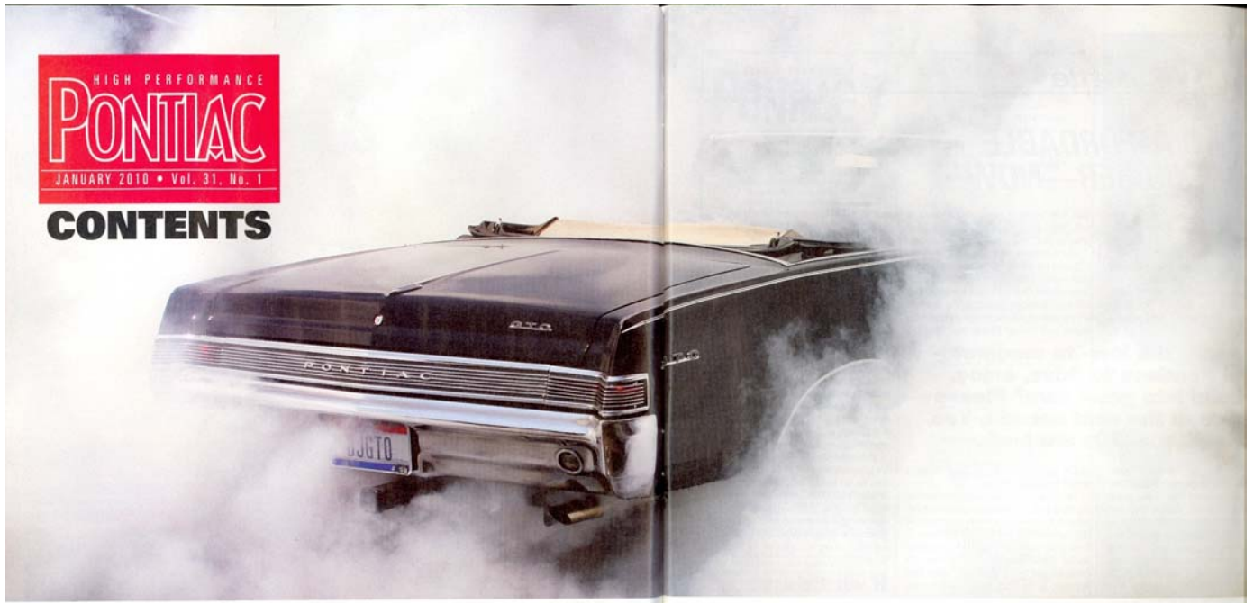
Dan Junior's burnout at 2009 GTOAA Nationals, feature picture in January issue of High Performance Pontiac on content page.

DJ GTO PARTS GTO Parts and Cars $$ BOUGHT AND SOLD! $$ Always parting out old cars. Have good inventory. NEED HELP HAVE QUESTIONS Contact: Dan 740-474-4614 www.djgtoparts.com